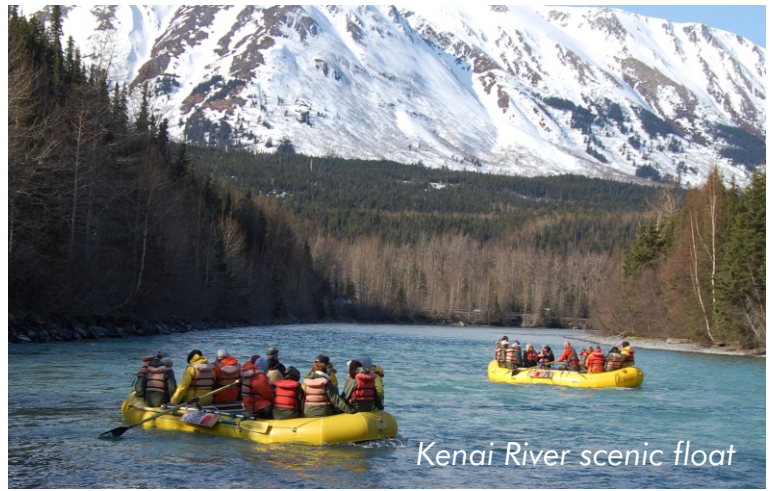
Kenai River scenic float